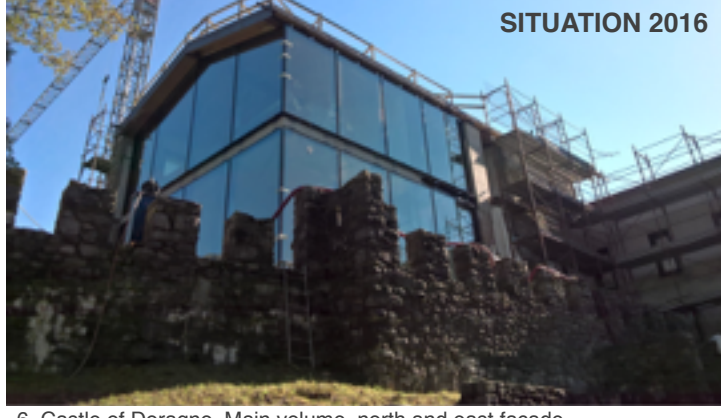
6. Castle of Doragno, Main volume, north and east facade