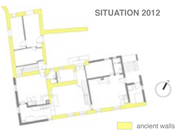
2. Layout of the Castle