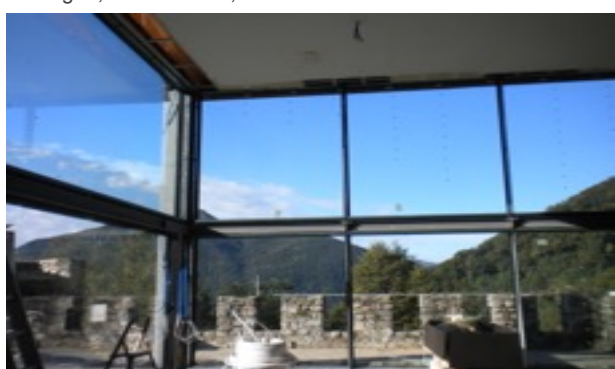
8. Castle of Doragno, first floor, living room