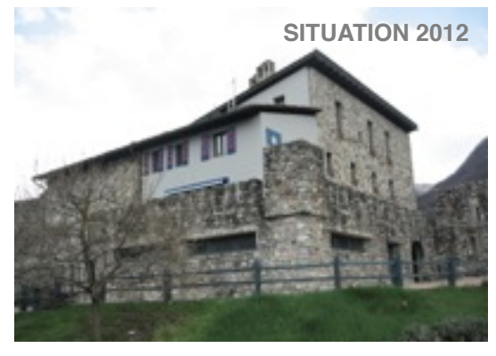
4. Castle of Doragno, Main volume, south and west facade