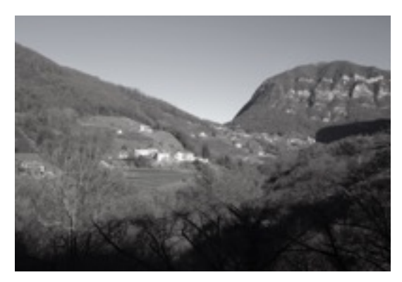
1. View from Castle