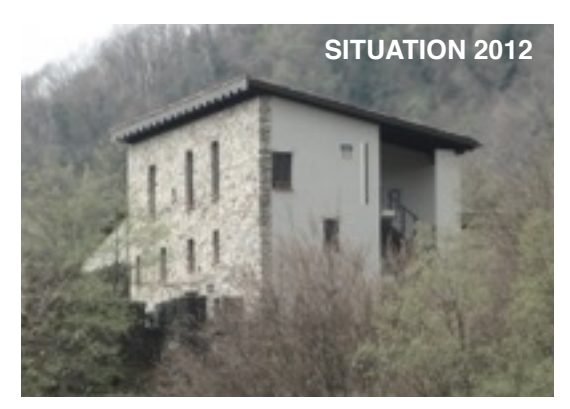
3. Castle of Doragno, Main volume, north and east facade