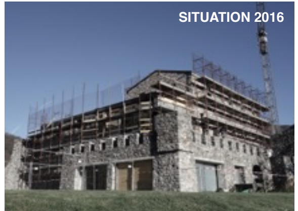
5. Castle of Doragno, south and west facade

In this project we have <u>re-created the shape of the castle</u> using modern materials that differ from the original ones but don't dominate and discretely approach to ancient parts.